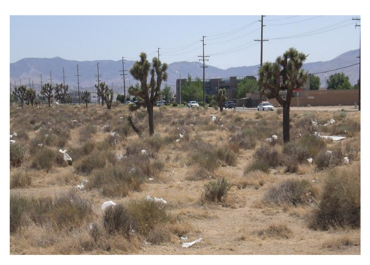
Figure 3 -- Plastic Carryout Bags Ruin The Otherwise Scenic Landscape Along Columbia Way In Palmdale

Communities within close proximity to landfills and other solid waste processing facilities are especially impacted as plastic carryout bags escape from trash trucks while traveling or emptying their loads. Although trucks and facilities are required to provide cover and fences, carryout bags manage to escape despite Best Management Practices (BMPs) including using roving patrols to pickup littered bags. Inevitably the cost for cleanup is passed on to residents in the form of higher disposal costs. Despite the efforts of various cleanup activities and thousands of residents who annually volunteer countless hours in beach, roadside (e.g., Adopt-A-Highway programs), park, and neighborhood cleanups, plastic carryout bag litter remains a significant problem.