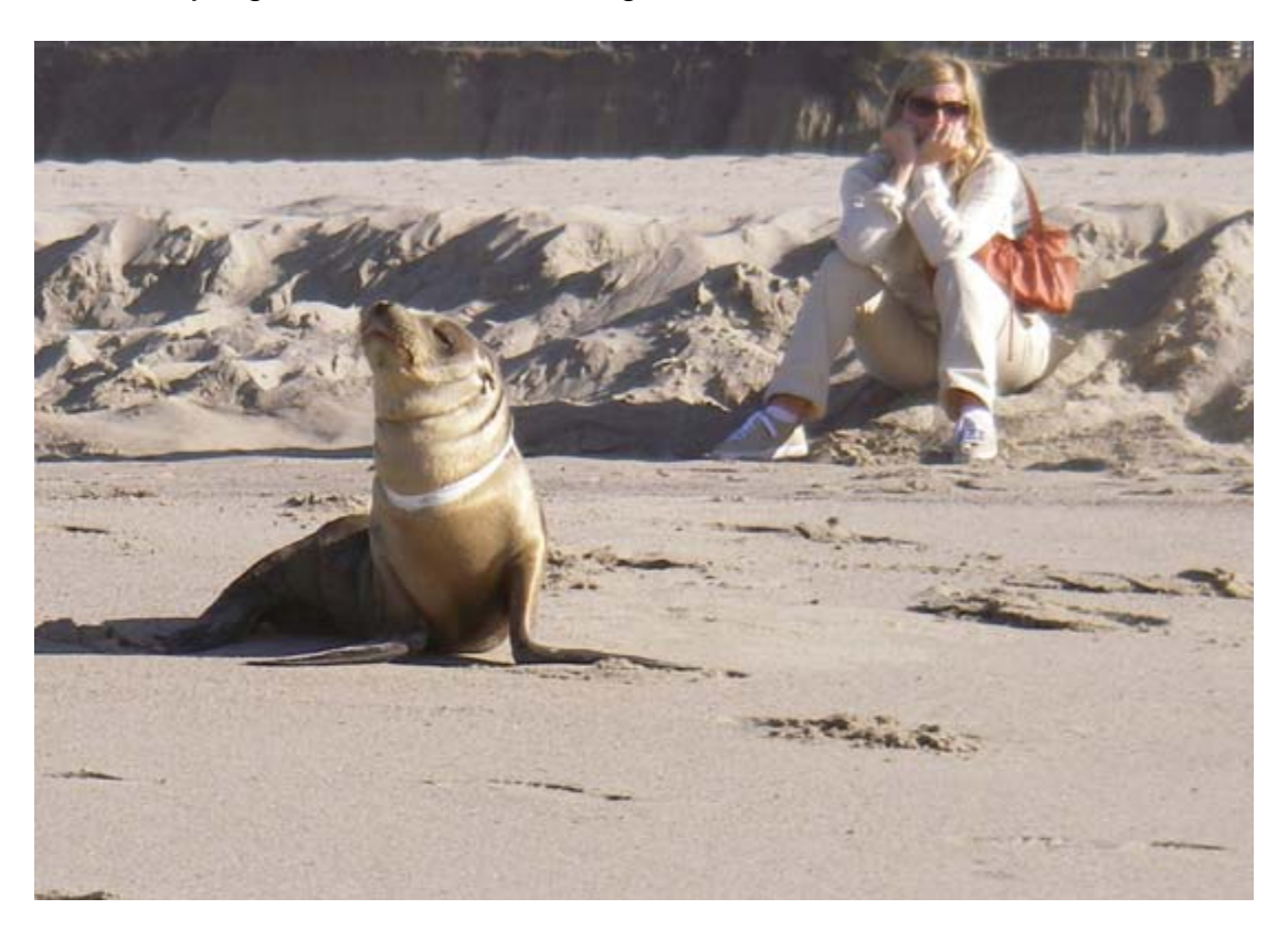
Figure 10 -- Seal Entangled in Plastic Bag

natural habitats of many different species of marine wildlife.<sup>43</sup> Recent studies indicate that plastic carryout bags also contain many different additives such as PCBs, DDT and nonylphenols and in turn can seep into marine animals that inadvertently ingest them, which endangers their health.<sup>44</sup>