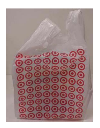
Figure 5 -- HDPE 2 Plastic Carryout Bag