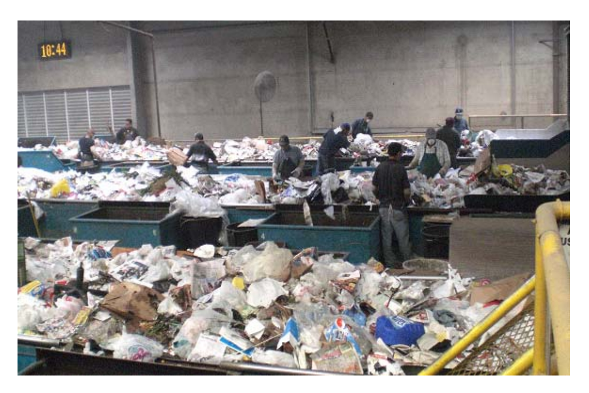
Figure 7 -- Typical Waste Stream Traveling Along a Conveyor Belt