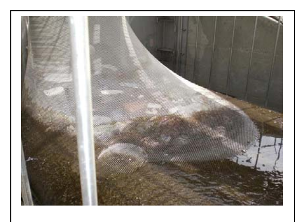
End-of-Pipe Net at Hamilton Bowl

Furthermore, Public Works installs and maintains numerous devices to allow for the removal of litter from the storm drain system. They include 1,026 catch basin inserts and 1,826 curb inlet catch basin retractable screens, 61 "full capture" hydrodynamic separators, 4 end-of-pipe screens, and 21 in-stream floating booms or nets.