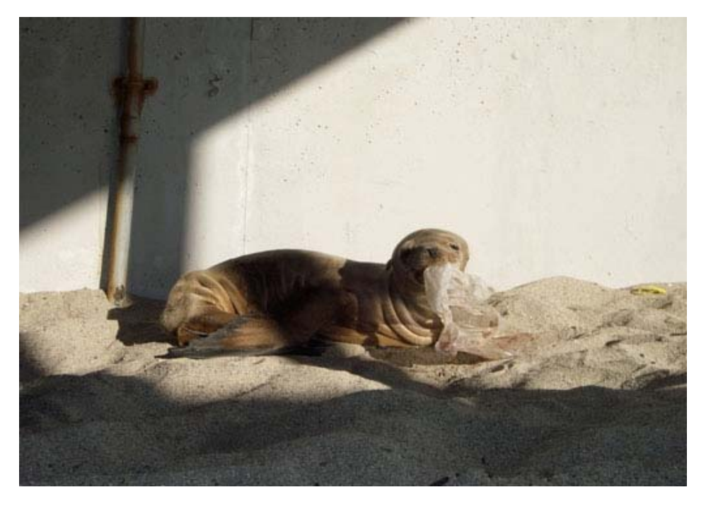
Figure 2 -- Seal Chewing on a Plastic Bag

The indiscriminate littering of plastic carryout bags is an increasing blight problem. Although plastic carryout bags are inexpensive and have other useful qualities, they have a propensity to become litter, thus overshadowing these benefits. Due to their expansive and lightweight characteristics, wind easily carries these bags airborne like parachutes. They end up entangled in brush, tossed around along freeways, and caught on fences. Because it is often white or brightly colored and difficult to collect, plastic carryout bag litter is a greater eyesore and nuisance than other littered materials. For this reason, there is an increasing need to diminish the prevalence of plastic carryout bags to maintain a clean and healthy environment, positively enhance the County's recreational and tourism economy, and improve the quality of life for all residents countywide.