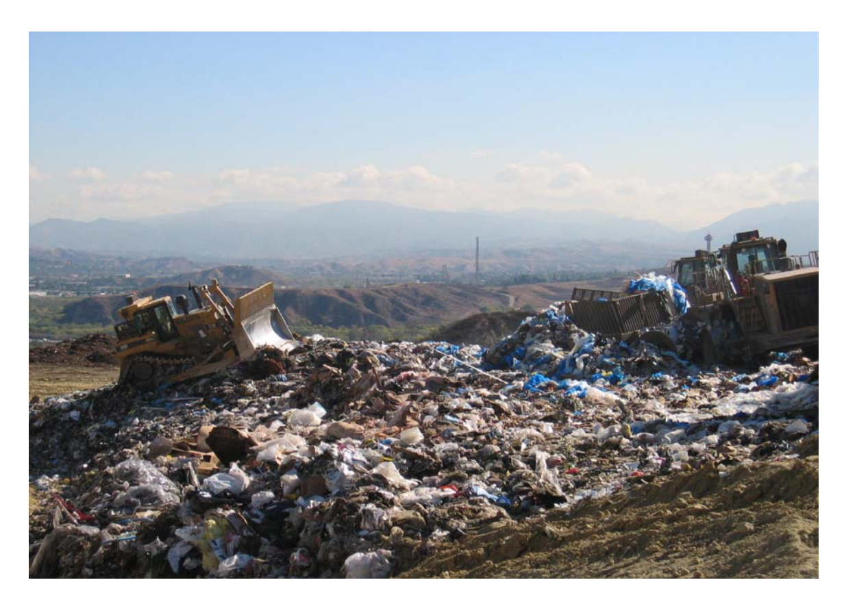
Figure 1 -- Typical Landfill Activity