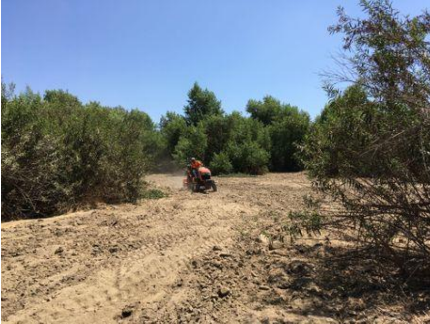
Log Entry Photo C