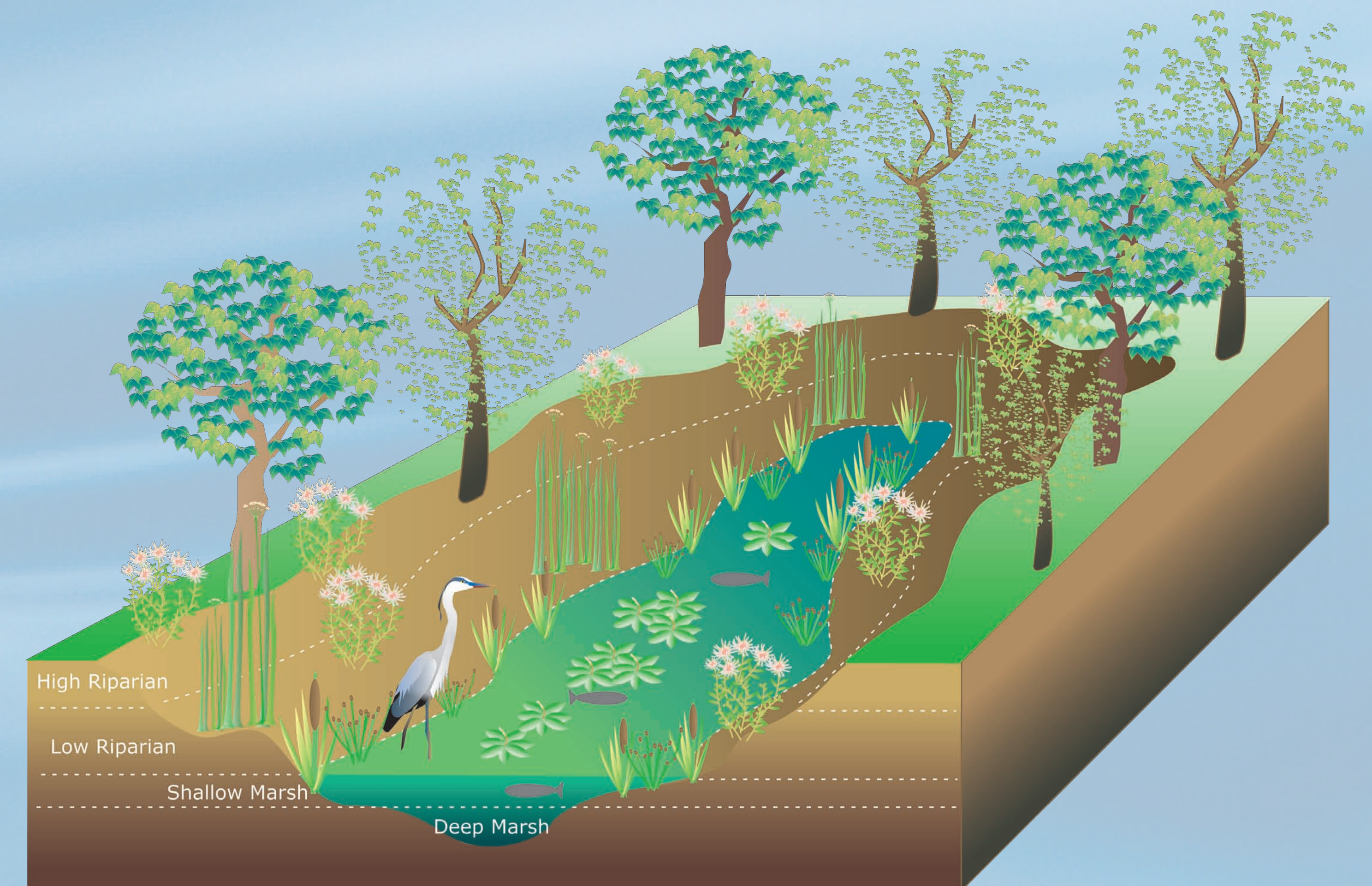
Varying water depths create different habitats